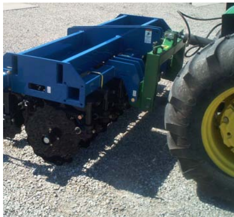
Category-1 and -2 3-point hitch models to 6, 8 and 10 foot widths. Trailer versions are available to a maximum width of 16 feet. All sizes come with supplemental weight bins.