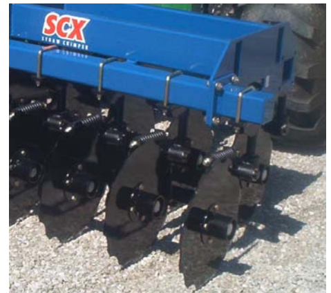
Pivoting coupler assembly with heavy-duty, heat-treated, spring-loaded notched discs, prevents rocks from wedging between discs.