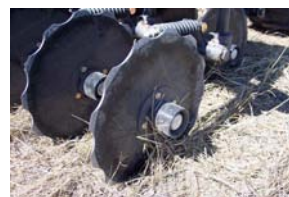
Rock Guards prevent damage to bearing hubcaps.