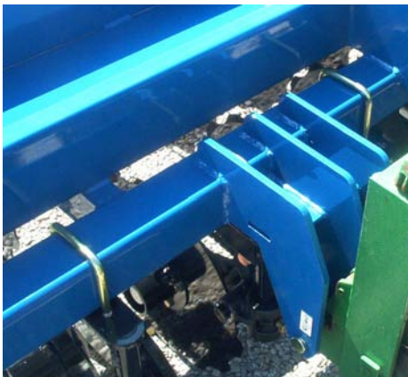
Heavy gauge tubular frame stands up to the toughest conditions.

Burchland's ALL NEW SCX Straw Crimper lets you say good-bye to poorly secured, uneven straw installation due to rocks, roots, stumps—and even sidewalks. Why? Because each SCX disc can pivot left and right and up and down—independently from each other. No other crimper offers this time saving, quality installation feature. When a conventional single-shaft crimper hits a rock, the whole shaft lifts up and can totally disengage the soil. Not so with the SCX. When an SCX disc hits an object, it floats over or pivots around it , while the other discs remain firmly engaged with the soil. The disc pivoting action also allows for smoother, tighter turns for faster installation. These features along with the SCX's sturdy construction and ease of operation let you confidently and uniformly crimp straw—that will stay crimped—to keep soil in place and undisturbed... even in high winds or heavy rainfall. Give us a call today! 641-498-2063